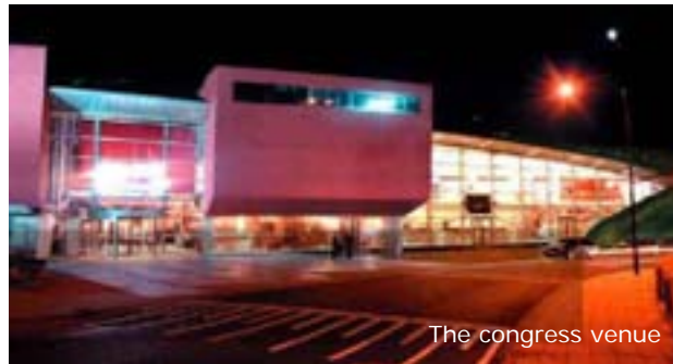
The congress venue

Over the past 25 years, the concepts and tools of Landscape Ecology have been established and developed. They are now widely applied throughout a range of research and applications from landuse change and sustainability to biodiversity and conservation planning, ecological networks and global change. Indeed, Landscape Ecological principles have been recognised as so important that they have been used to set national biodiversity programmes.