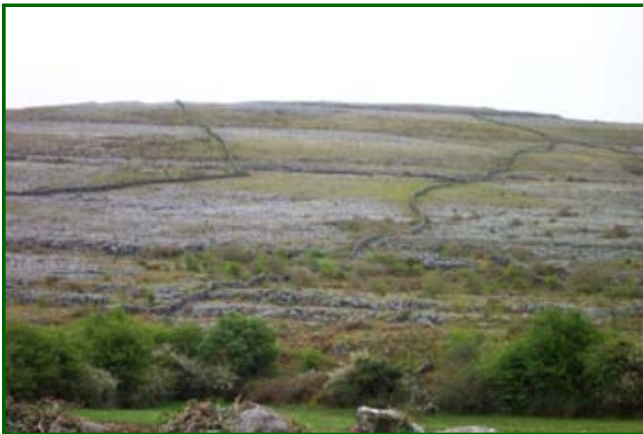
Agriculture plays both a beneficial and destructive role in plant and habitat conservation (Burren landscape near Kilfenora)

Make recommendations from hedgerow survey reports widely available