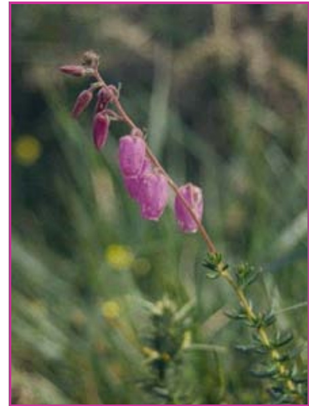
Daboecia cantabrica A species of heather named after the Irish saint St. Dabeoc.

Preliminary Census Catalogue of Marine & Freshwater algae available on-line by 2007