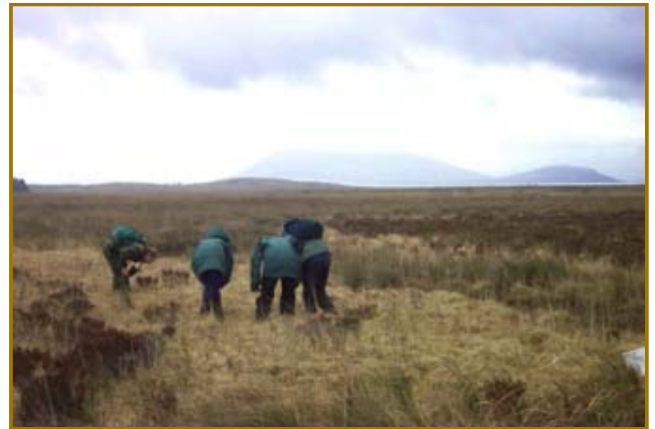
Fens are amongst the most threatened habitats in Ireland

This target supports actions 31 and 78 of the National Biodiversity Plan, and specifically looks at conserving habitats rather than species.