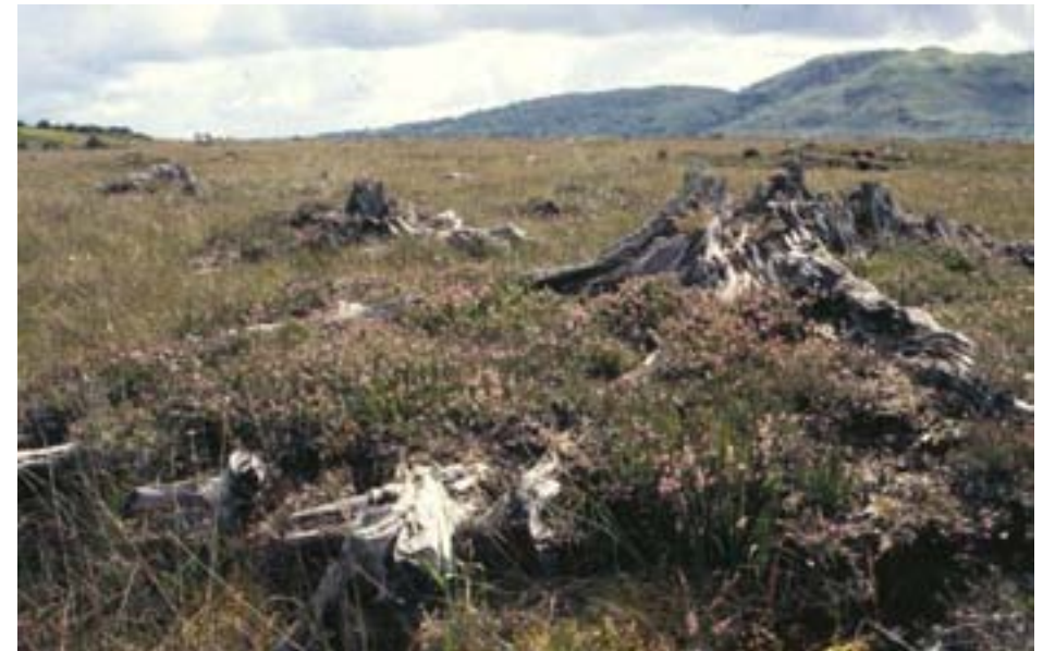
Blanket bogs have been a source of fuel in Ireland for millenia

Guidelines developed for smallholder turf cutting.