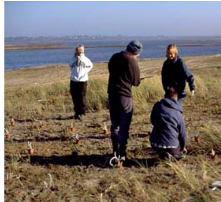
Transplanting experiments on Otanthus maritimus (Co Wexford)

Target 3: Comprehensive and documented suite of practical solutions based on new or tested models, case studies, research and other experiences available for plant conservation and sustainable use in Ireland.