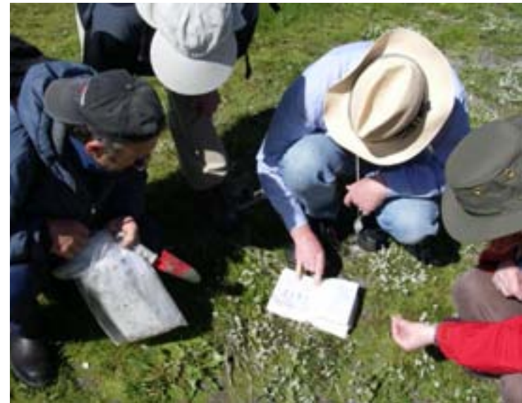
National Botanic Gardens staff learning to identify the Irish flora

Improve capacity amongst government, the NGO, university, industry, voluntary and private sectors, to implement the National Plant Conservation Strategy and achieve its targets, by 2010.