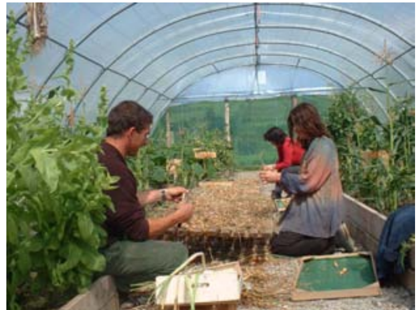
Volunteers at the Irish Seed Savers Association

2006 meeting of Network to look at Important Areas for Plant Diversity pilot studies, a preliminary Red Data List, and review other targets.