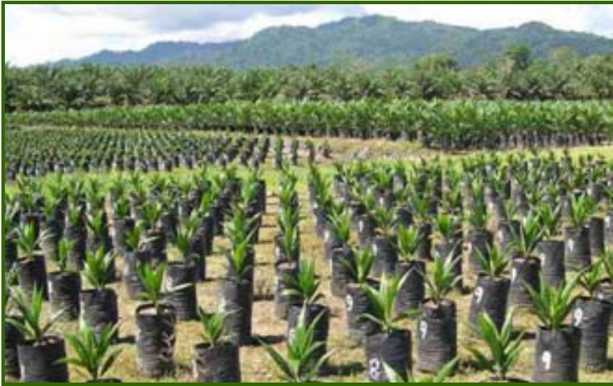
Oil Palm plantation in Papua New Guinea, a cause of forest clearance and potential source of cheap biodiesel for Irish power generating stations

Develop a policy and enact legislation for access and benefit sharing by 2007.