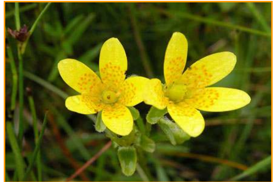
Saxifraga hirculus , marsh saxifrage, is confined to fens in the north-west of Ireland

Protected areas provide the only current means of conservation. Public awareness and landowner co-operation are potentially valuable avenues to explore. Actions 21, 22, 23 & 24 of the National Biodiversity Plan cover monitoring and assessment of protected area legislation.