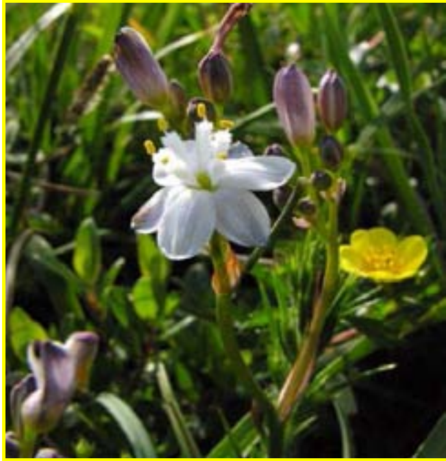
Simethis planifolia – the Kerry lily, a critically endangered species from south-west Ireland

Wildlife Service is currently sponsoring endangered Bryophyte surveys of a number of vice counties each year. A database of all threatened plants is currently being completed by Wildlife.