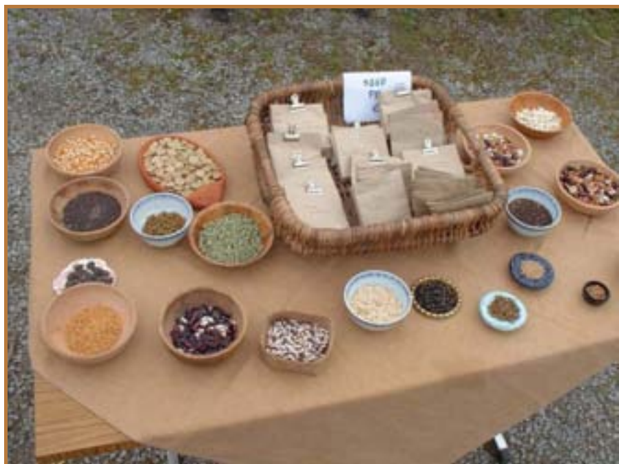
Seed table at Irish Seed Savers Association, a voluntary organisation dedicated to the location and preservation of traditional fruit and vegetable varieties

Many agricultural crops being bred in Ireland today supply a rather small and specialist market including malting Barleys and sugar beet. By targeting heritage crops and vegetables there will be some ability to document and secure these varieties. The genetic integrity of these agriculturally important species have also been addressed under action 35 of the National Biodiversity Plan.