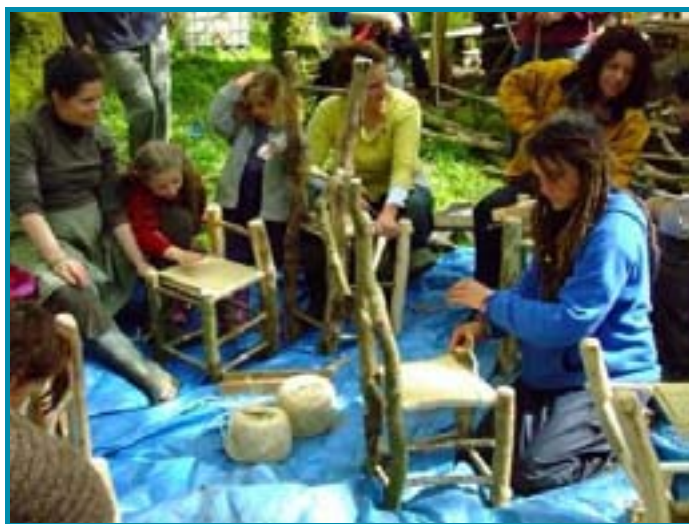
Traditional furniture making at the Centre for Environmental Living & Training

Discuss with the Heritage Council the possibility of publishing a call for proposals for local projects on plant folklore etc.