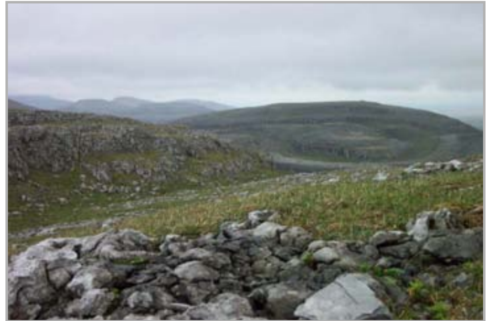
The Karst landscape of the Burren supports one of the richest of Ireland's plant biomes

Undertake 3 pilot studies which will identify Important Areas for Plant Diversity in Dublin ( DNFC ), Westmeath (Con Breen), and East Galway ( GNFC ) by October 2006.