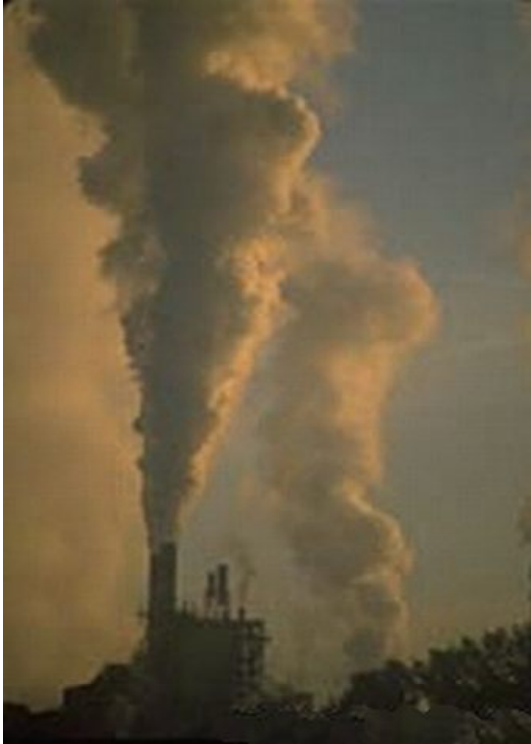
East Galway Against Incineration E.G.A.I

Planning permission is being proposed to build a waste incinerator and two land fill sites, one for waste and one for the toxic by-product of the incinerator, at the Tynagh Mines Site in East Galway. Do you live within 40 miles of this site ?